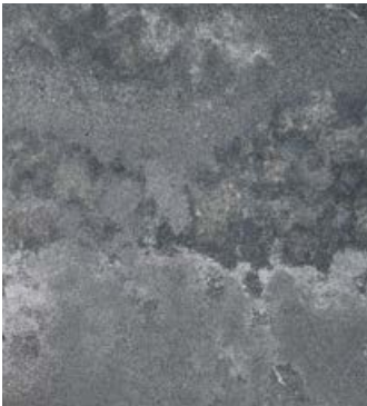
Rugged Concrete™ 4033 R SN