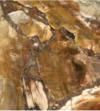
Petrified Wood™ 8330 C