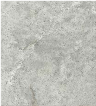
Bianco Drift™ 6131 SN