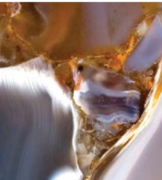
Brown Agate™ 8310 C