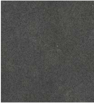
Raven™ 4120 D