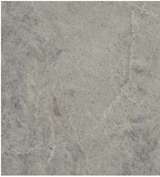
Symphony Grey™ 5133 NEW! SN