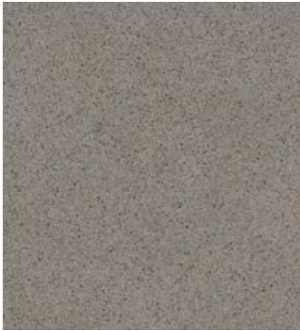
Oyster™ 4030 D