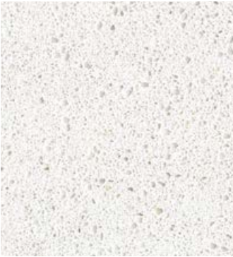
Ocean Foam™ 6141S