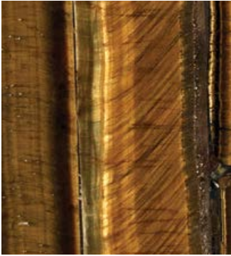
Red Tiger Eye™ 8630 C