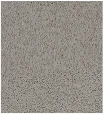
Urban™ 2040 S

Concrete Finish surfaces may require increased daily maintenance due to their unique patterns and finishes. Due to the authentic robust design of some of the decors and its inherent textural movement and patina, some variations in visual appearance may occur between slabs.