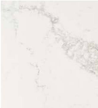
Statuario Maximus™ 5031SNU