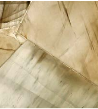
Aragonite™ 8617 C