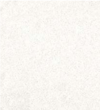
Organic White™ 4600G D