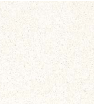
Snow™ 2141G S