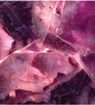
Amethyst™ 8551 C

A collection of extraordinary surfaces hand-made from individually cut and bound semi-precious stones. Available by special order, lead-times apply.