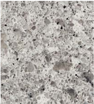
Atlantic Salt™ 6270 S