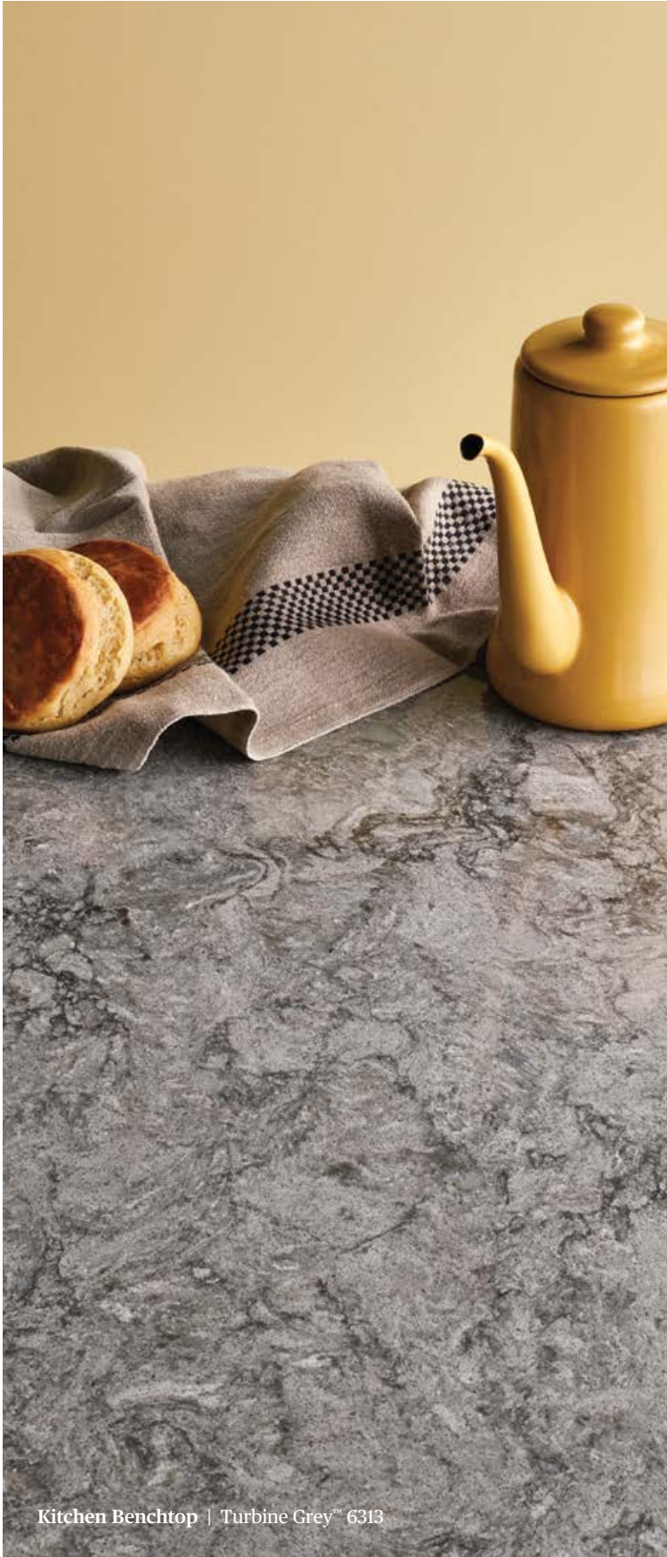
Kitchen Benchtop | Turbine Grey™ 6313

Caesarstone® is made from natural quartz and therefore some variation in colour and aggregate may occur. The colours in this brochure are to the highest standards in printing, however, should only be used as an indication of actual product design. We always recommend making a final colour selection by viewing displays of larger panels in your nearest Caesarstone® showroom or kitchen retail showroom to appreciate the movement of the design over a large surface.