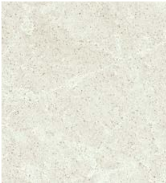
Cosmopolitan White™ 5130NEW! SN