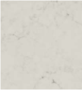
London Grey™ 5000 SN