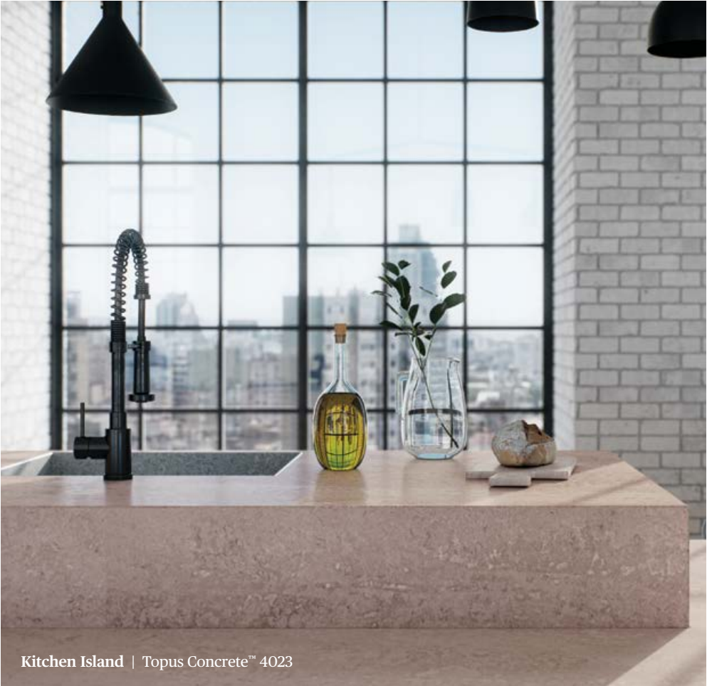
Kitchen Island | Topus Concrete™ 4023