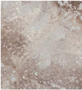
Excava™ 4046 NEW! R SNU