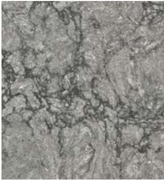
Turbine Grey™ 6313 NEW! SN