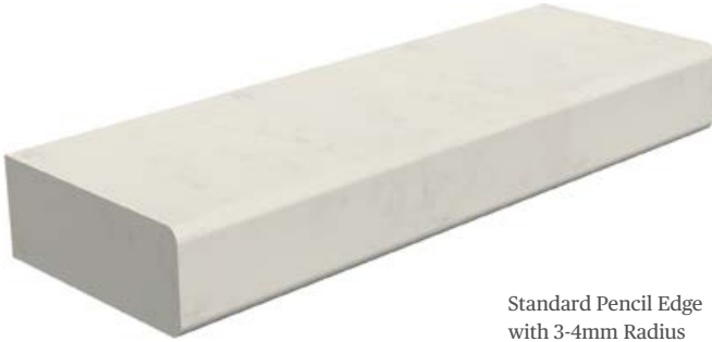
Standard Pencil Edge with 3-4mm Radius

Caesarstone® recommends a minimum radius of 3-4mm on any edge detail for optimal strength and durability. There are many edge profiles to choose from, including single thickness 20mm or 30mm slabs, through to laminated double thickness edge options.