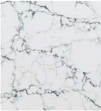
White Attica™ 5143 SN