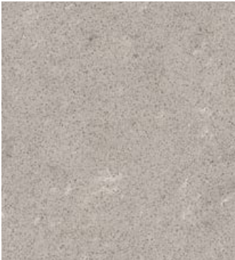
Clamshell™ 4130 D