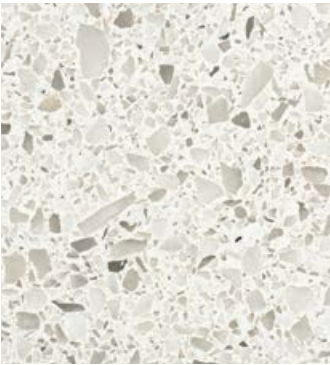
Nougat™ 6600G S