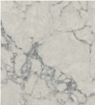
Noble Grey™ 5211 SN