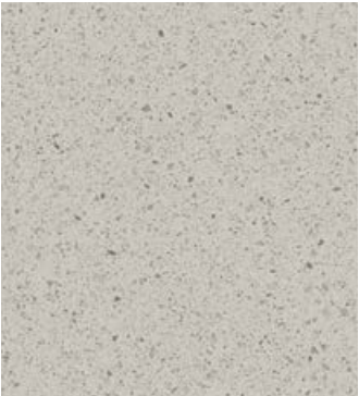
Nordic Loft™ 6041 S