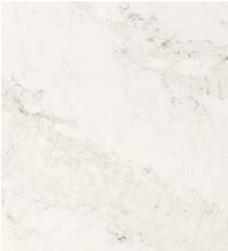
Calacatta Nuvo™ 5131 SNU