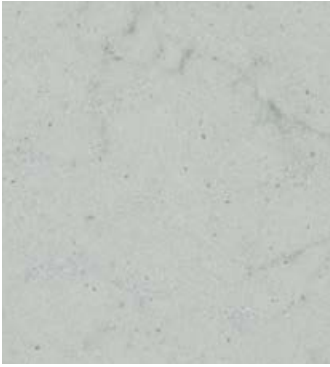
Georgian Bluffs™ 6134 D