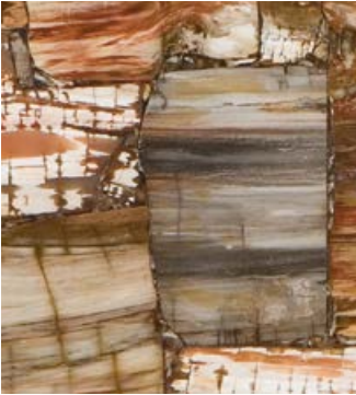
Petrified Wood Classic™ 8331 C