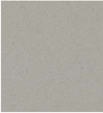
Raw Concrete™ 4004 G C D