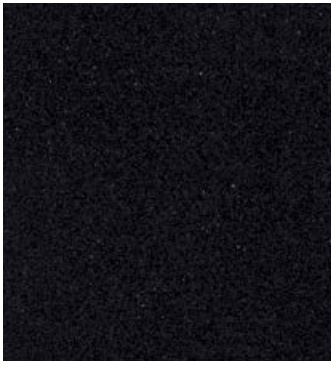
Jet Black™ 3100 S

Slab Thickness: S Standard Slab 20mm = 198-206 kg (45-47kg per m 2 ) 30mm = 299-310 kg (68-71kg per m 2 ) G Grande Slab 20mm = 260kg (50kg per m 2 ) 30mm = 387kg (75kg per m 2 ) Slab Size: S Standard Slab 3,050mm x 1,440mm (Nominal) G Grande Slab 3,340mm x 1,640mm (Nominal)