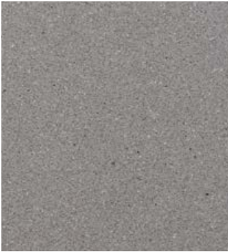
Sleek Concrete™ 4003 C G S