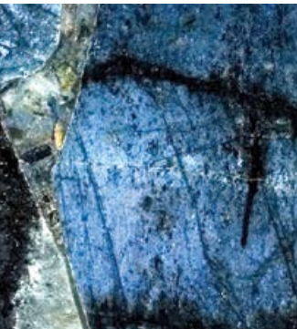
Dumortierite™ 8540 C