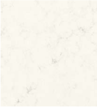
Frosty Carrina™ 5141 G SN