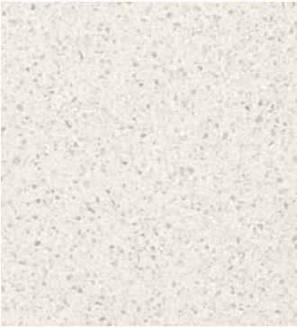
Ice Snow™ 9141G P