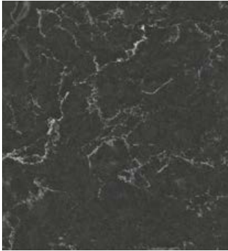
Piatra Grey™ 5003 SN