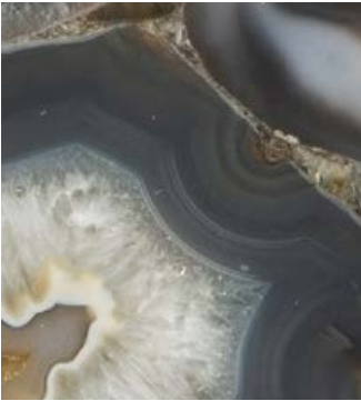
Grey Agate™ 8311 C