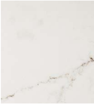
Statuario Nuvo™ 5111SNU