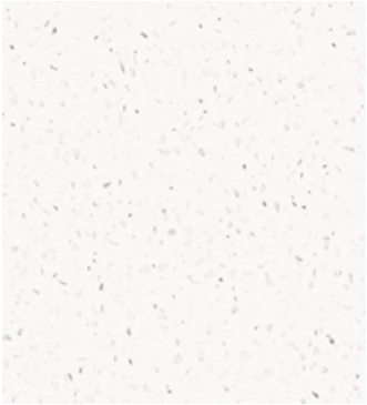
Intense White™ 6011 S