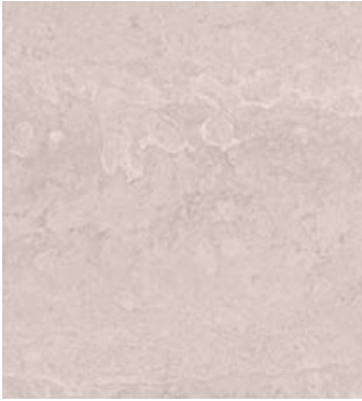
Topus Concrete™ 4023 NEW! R SN