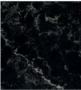
Vanilla Noir™ 5100 SN