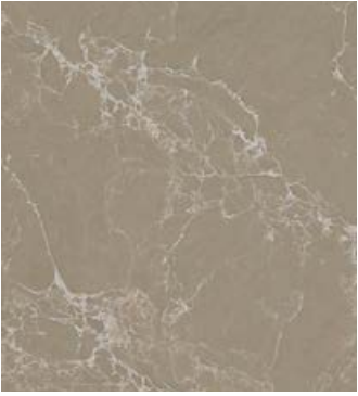
Tuscan Dawn™ 5104 SN