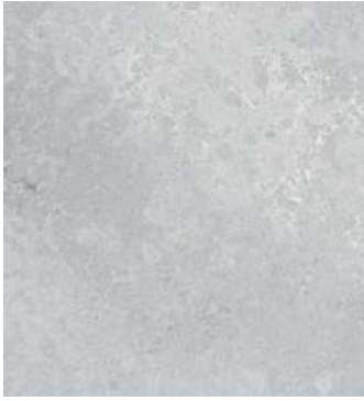
Airy Concrete™ 4044 NEW! R SN