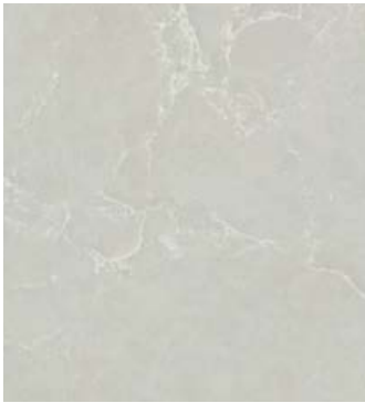
Alpine Mist™ 5110SN