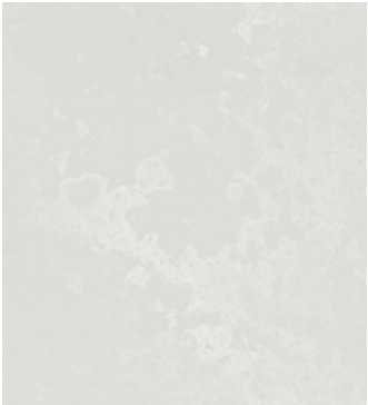
Cloudburst Concrete™ 4011 R SN