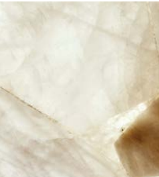
White Quartz™ 8141 C